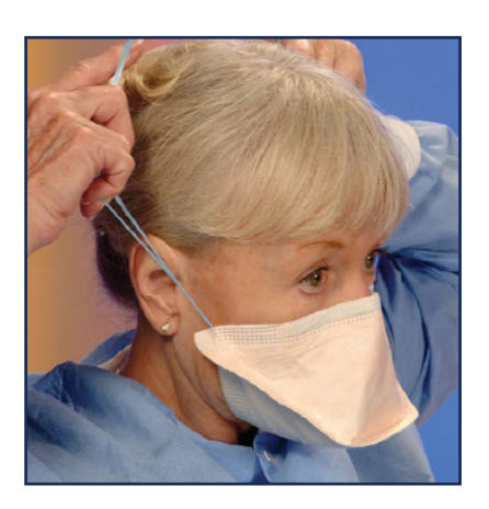
Ask about our HALYARD* Qualitative Fit Test Kit

Contains all the materials and instructions you need to conduct Fit Testing of N95 Respirators. Each kit contains supplies for 75-100 fit tests. Order code 47950.